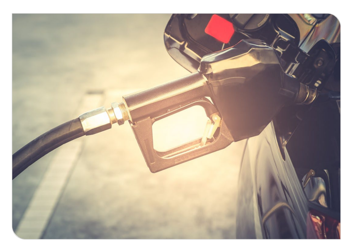
Version 4.1 • 07 December 2022 – 31 December 2027