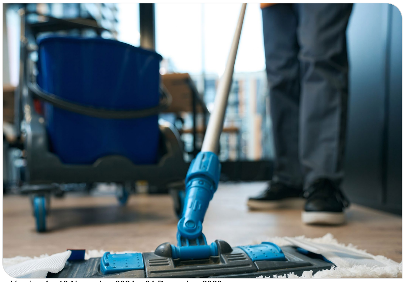
Version 4 • 18 November 2024 – 01 December 2029